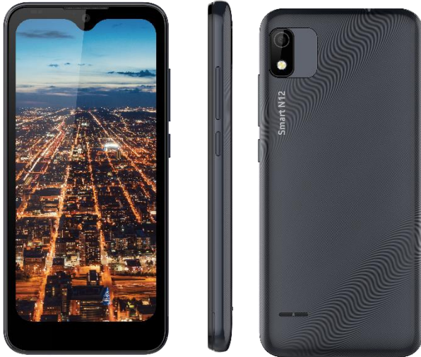
Smart N12 GH5581 ITUHA